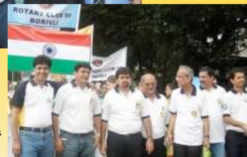
Organising Eye Donation Awareness Rally on 15th August.