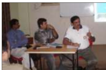
Meeting Of Office Bearers, Directors And Chairmen Of Various Committees Roles And Responsibilities Of Club Officers.

described the areas of action for each office bearer. The pp was very painstakingly prepared being precise and also naming and having a photograph of the person concerned.