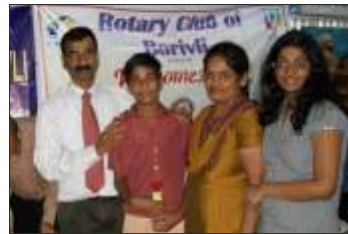
President adopting a child